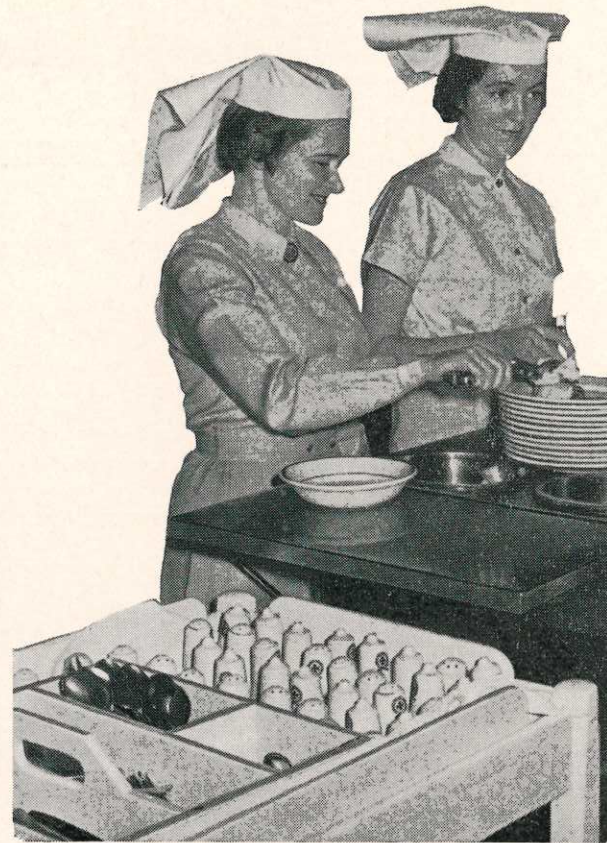
Ward meal time.