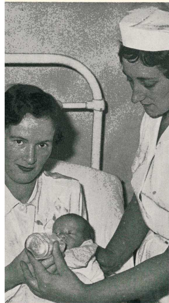
Another new life— a happy mother and her babe.